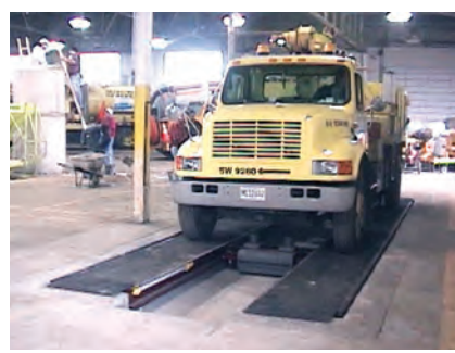
Surface in recessed installation