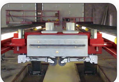
Runway wheel kit legs retract for easy rolling jack removal