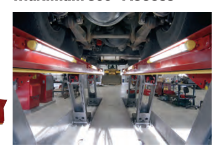
No front-to-rear obstructions