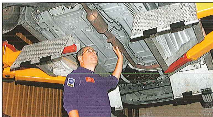
Diamond plated for enhanced traction

EASY ACCESS. Mohawk Speedlane gives you full working access to the underside of the car. Great for uni-bodies or full frame trucks