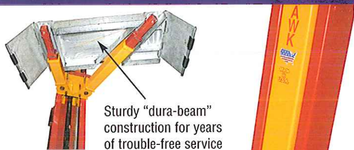
Sturdy "dura-beam" construction for years of trouble-free service

FLEXIBLE. Use one or both adapters as the job requires. Or remove Speedlane entirely in seconds.