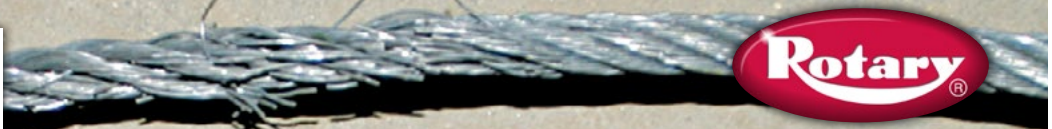
3/8" Cables on other lifts

Note that both trucks are Chevy Silverado's and the truck on the left has the added weight of a snow plow mount. Note the 90 degree angle of the swing arm and column showing the Mohawk Lift has no deflection when raising a 1 ton pickup.