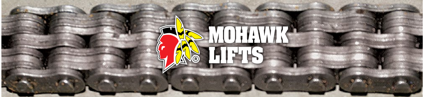
Mohawk 1 7/16" lifting chain